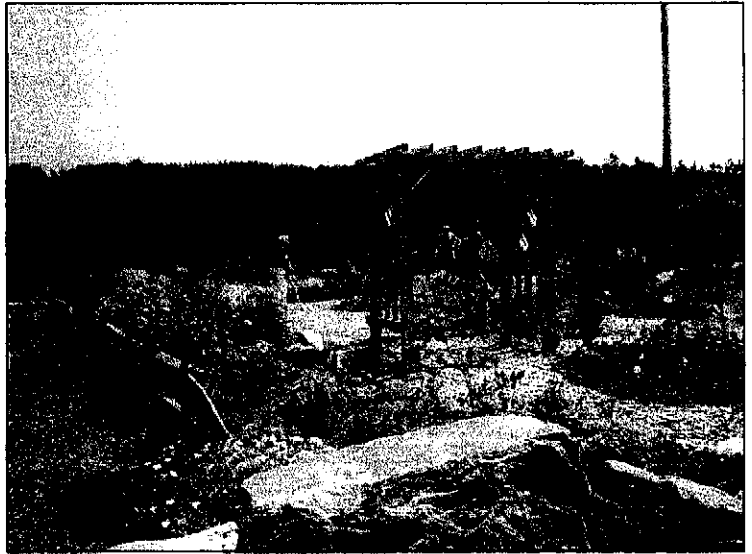
Volunteers work at the community garden at Ski Bowl Park